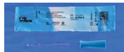
The Cure Ultra features a pre-lubricated straight tip with polished eyelets and 'No-Roll' connector/funnel end.

The sterile, single use Cure Ultra is a ready to use catheter for women. The small package features an easy tear top and enables disposal of minimal material. The catheter features polished eyelets on a pre-lubricated straight tip and a unique, 'No Roll' connector/funnel end. It is ideal when discretion and convenience are important considerations.